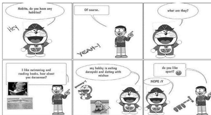
Figure 2. Comic strips