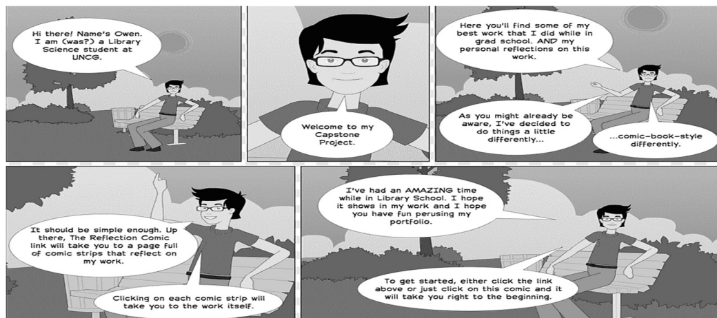
Figure 4. Comic strips

Learning media is a medium used to transmit information to students throughout the learning process (Jewitt, Clark, & Hadjithoma-Garstka, 2011; Aryuntini, Astuti, & Yuliana, 2018). This community service project (PKM) uses comic strips as a learning tool. Comic strip media is a comic strip that contains educational material that is conveyed to students by the teacher. This media increases student interest in learning and enhances student learning outcomes. Previously, teachers only utilized traditional methods and media such as Infocus and blackboards as learning media, but this time the service team produced very engaging media for students in order to increase student engagement and, of course, improve student learning outcomes.