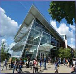
The University of Akron