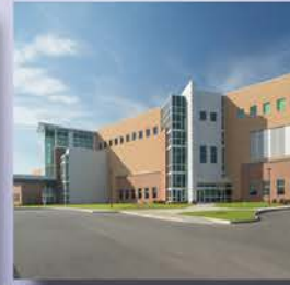
Northeast Ohio Medical University