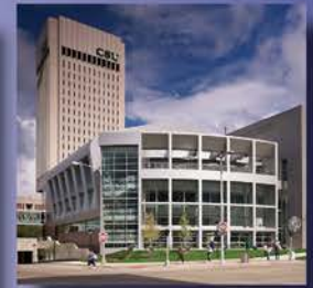
Cleveland State University