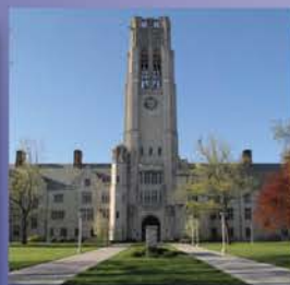
The University of Toledo