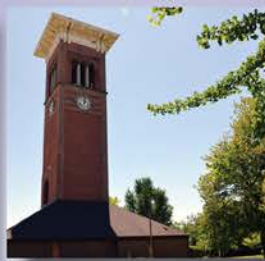
Central State University