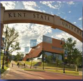
Kent State University