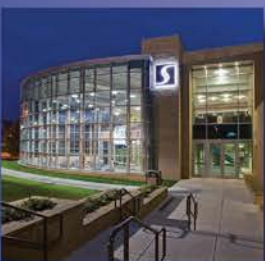
Shawnee State University