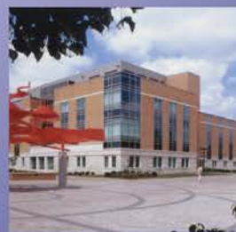
Wright State University