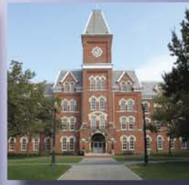
The Ohio State University