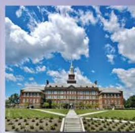
University of Cincinnati