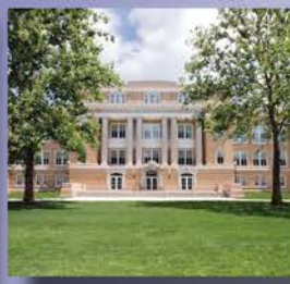
Bowling Green State University