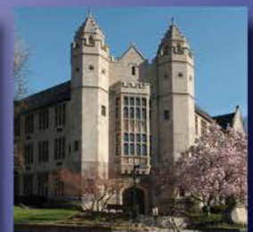
Youngstown State University